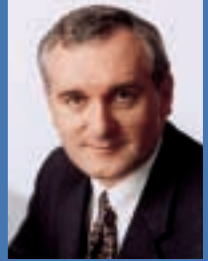
Bertie Ahern, TD Taoiseach

I would like to extend a warm welcome to you to Government Buildings, a landmark feature of Dublin City and the seat of Irish Government. The building is a striking example of public architecture of the early 20th Century, which was beautifully adapted by the Office of Public Works as the home for my Department.